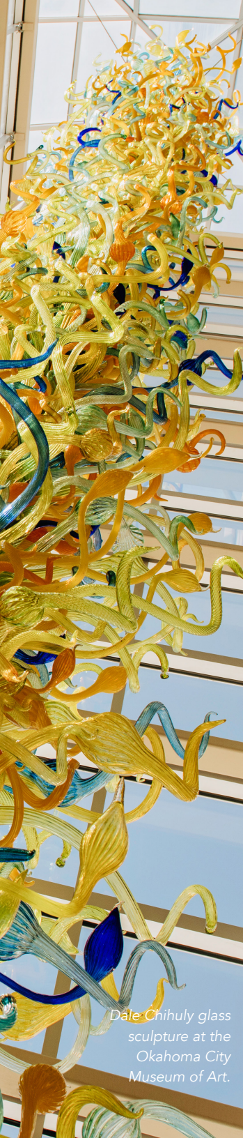
Dale Chihuly glass sculpture at the Okahoma City Museum of Art.